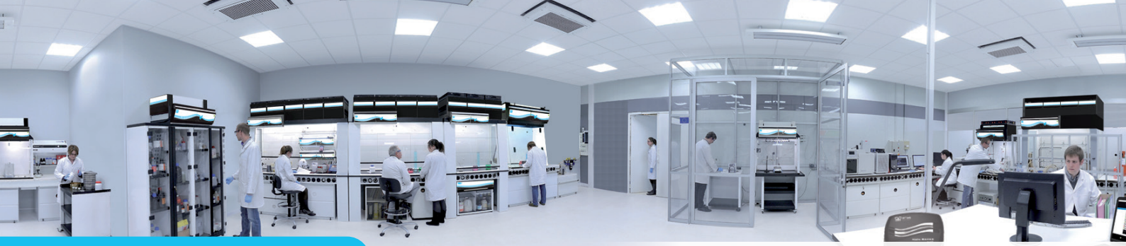
The Erlab Research and Development laboratory